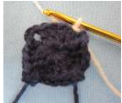
Change colour on last ch